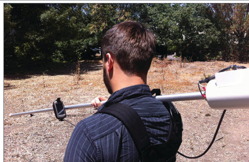
G-857 and Optional Garmin® GPS

The G-857 provides a reliable, low-cost solution for a variety of magnetic search and mapping applications. Single keystroke operation means the G-857 can be operated by non-technical field personnel and used in teaching environments. The G-857 uses the well-established proton precession method, allowing accurate measurements to be made with virtually no dependence upon variables such as sensor orientation, temperature or location. The unit provides a repeatable absolute total field magnetic reading, traceable to the National Institute of Standards and Technology.