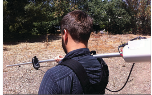
G-857 and Optional Garmin® GPS

The G-857 provides a reliable, low-cost solution for a variety of magnetic search and mapping applications. Single keystroke operation means the G-857 can be operated by non-technical field personnel and used in teaching environments. The G-857 uses the well-established proton precession method, allowing accurate measurements to be made with virtually no dependence upon variables such as sensor orientation, temperature or location. The unit provides a repeatable absolute total field magnetic reading, traceable to the National Institute of Standards and Technology.